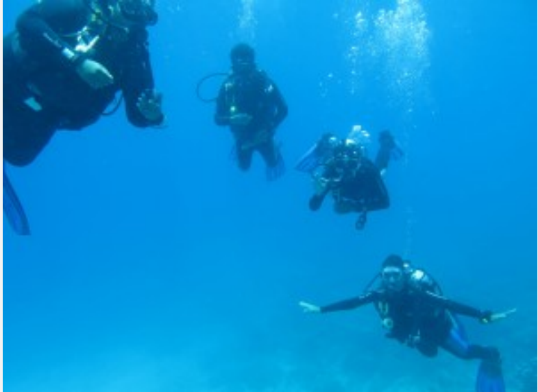
The interns search for mantas in Komodo National Park