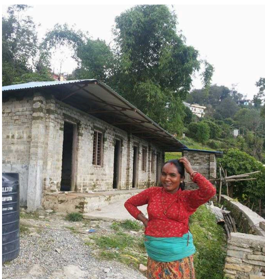
...to this. The first Guy Joseph ECDC is almost finished!

completed I will be able to send my children to a school near to home for good education. I did not stay in school but I wish this for my own children! She said she will always support the centre and thanked Guy's Trust for this project.