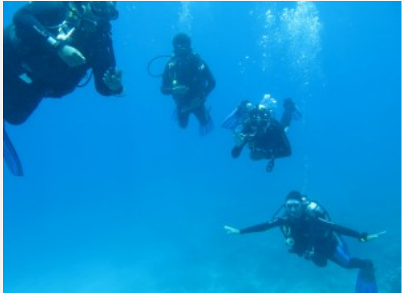
The interns search for mantas in Komodo National Park