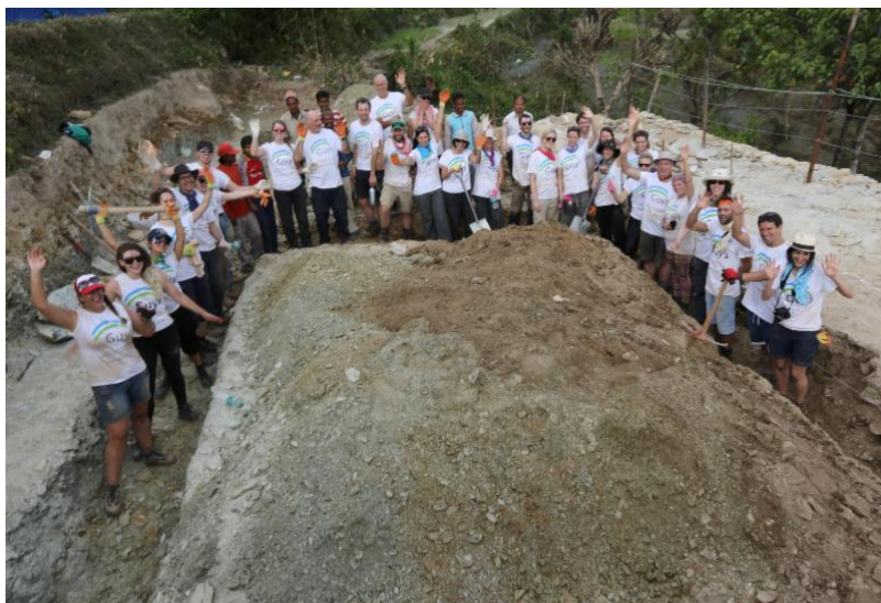
Our last day on site. From this....